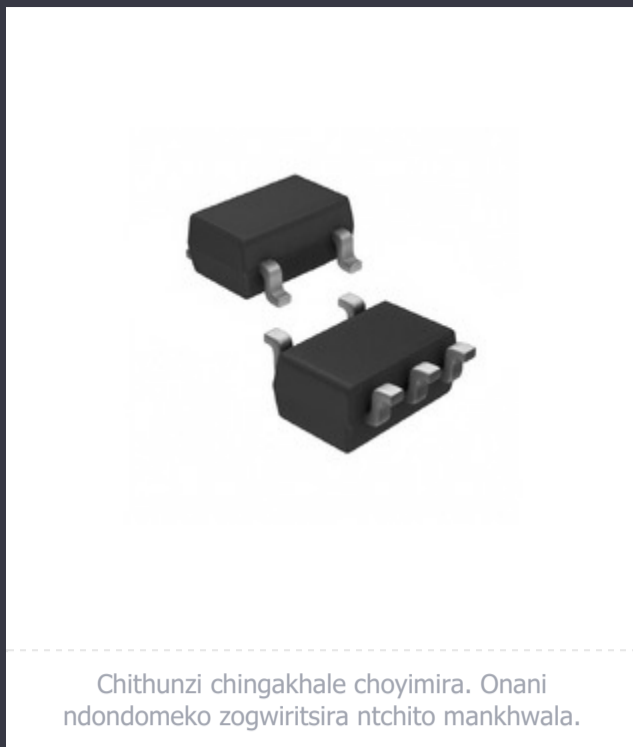
Chithunzi chingakhale choyimira. Onani ndondomeko zogwiritsira ntchito mankhwala.