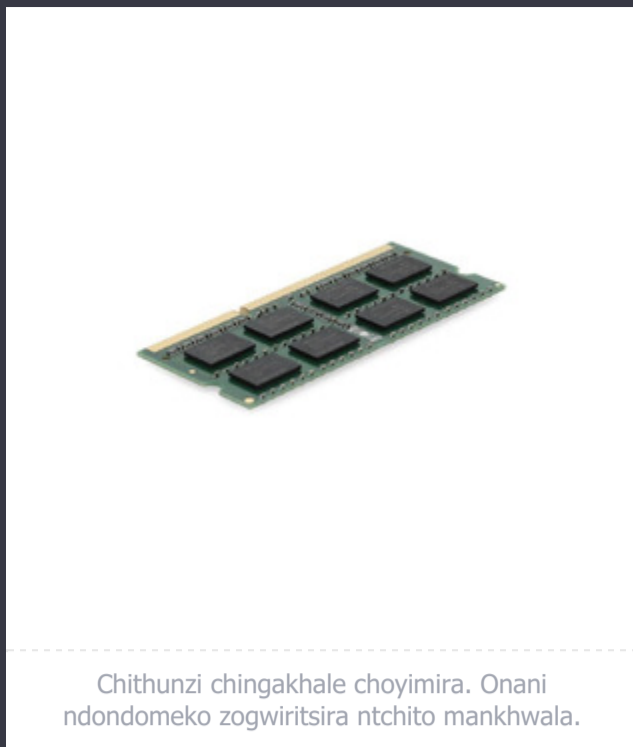
Chithunzi chingakhale choyimira. Onani ndondomeko zogwiritsira ntchito mankhwala.