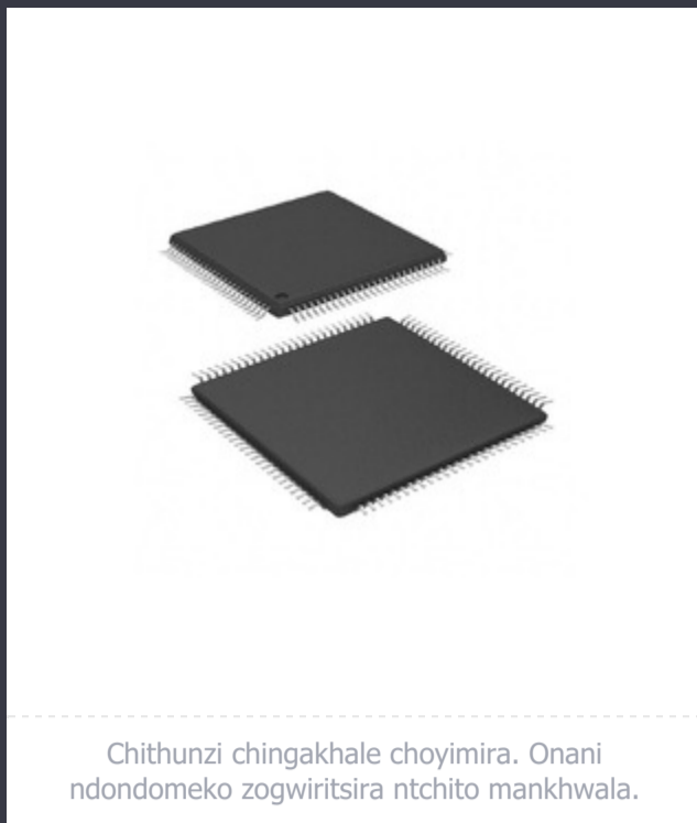
Chithunzi chingakhale choyimira. Onani ndondomeko zogwiritsira ntchito mankhwala.