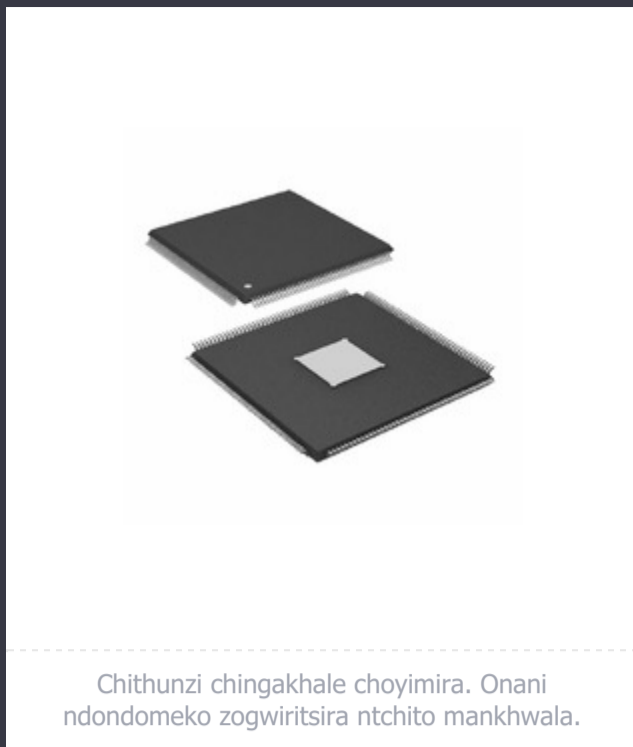
Chithunzi chingakhale choyimira. Onani ndondomeko zogwiritsira ntchito mankhwala.